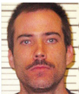
Eric Robert Rudolph

Mastermind of 1993 bombing of New York's World Trade Center