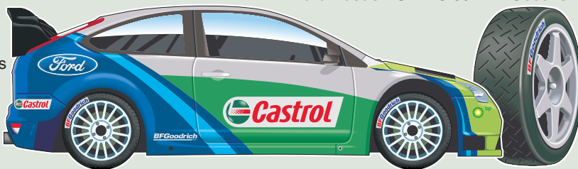
Ford Focus RS WRC 06 BFGoodrich

Ford starts renewed assault for rallying's top title with all-new Focus RS and acquisition of double champion Marcus Gronholm . Ford has scored points for 60 rallies in a row – and now has best hope to regain title since early 1980s