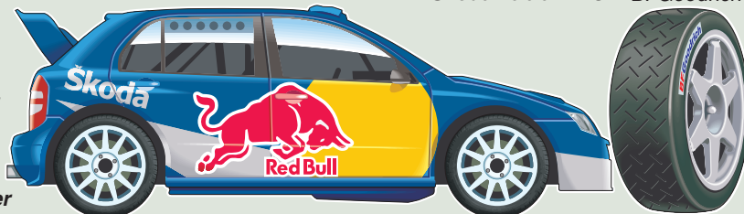
Skoda Fabia WRC BFGoodrich