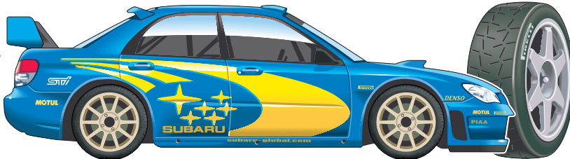
Subaru Impreza WRC 2006 Pirelli

Subaru kicks off season with stunningly aggressive new Impreza WRC 2006 . Petter Solberg , champion in 2003 and runner-up for last two years, will be hoping to spoil Sebastien Loeb's bid for a hat-trick in 2006