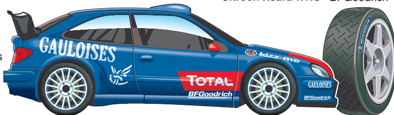
Citroen Xsara WRC BFGoodrich*

All change for Citroen as multi-winning French marque takes a year out to focus on developing C4 WRC model for 2007. Kronos – steadily building a reputation in WRC – and double drivers' champion Loeb look likely title contenders