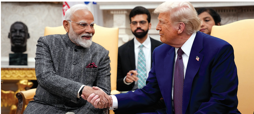
Above: India's Prime Minister Narendra Modi meets U.S. President Donald Trump at the White House, February 13, 2025

In what will be a blow to the funding of Vladimir Putin's war machine, India has signed a deal with the U.S. to lower tariffs against it in return for ending its importation of cheap Russian oil