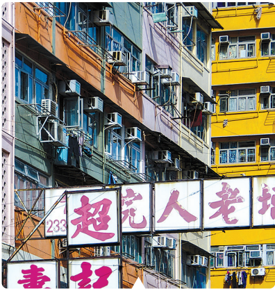
Air-con units cling to apartment buildings in Hong Kong

Installed cooling capacity is on a trajectory to almost triple by 2050, with the most rapid growth projected in Africa and South Asia