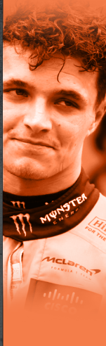
Lando Norris McLaren