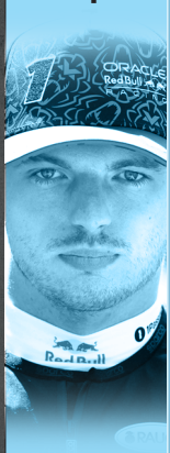
Max Verstappen Red Bull