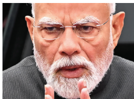
Narendra Modi India SCO silent over Pakistan conflict, seeks solution to border dispute with China