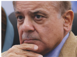
Shehbaz Sharif Pakistan Conflict with India over accusations of state-sponsored terrorism