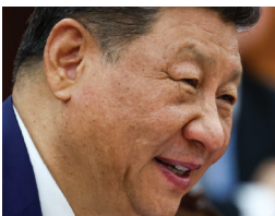
Xi Jinping China Balancing act to display unity but make substantive progress