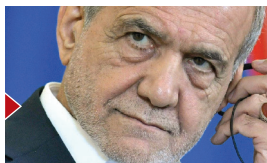
Masoud Pezeshkian Iran Relies on group to counter western containment