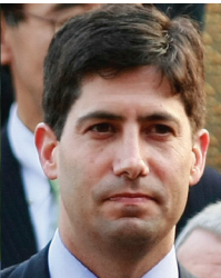
Kevin Warsh Fed Governor 2006-11. Favoured by Trump for position of Chair in first term but lost out to Powell