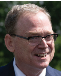
Kevin Hassett Director of National Economic Council and chair of Council of Economic Advisers in first Trump term