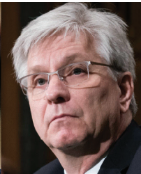
Christopher Waller Fed Governor advocating faster rate cuts, believes trade policy not inflationary but may cause price hikes