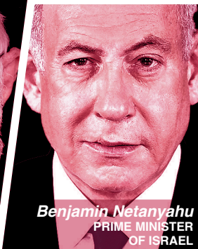
Benjamin Netanyahu PRIME MINISTER OF ISRAEL