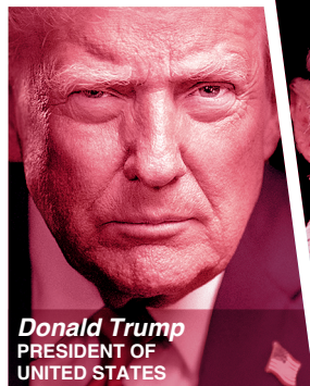
Donald Trump PRESIDENT OF UNITED STATES

Iran will be mulling over options on how to respond to the U.S. attack, from striking U.S. bases in the region, to blocking a key global shipping waterway – but all carry the risk of further retaliatory aggression