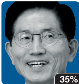
Kim Moon-soo People Power Party

Has narrowed over 20-point gap with Lee since campaign began on May 12, but has failed to persuade fellow conservative candidate – New Reform Party Lee Jun-seok (below) to quit and endorse him to boost his chances