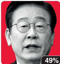
Lee Jae-myung Democratic Party

Liberal frontrunner Lee Jae-myung still leads his main conservative rival Kim Moon-soo by more than 10 percentage points, even though the race has tightened ahead of the election on June 3