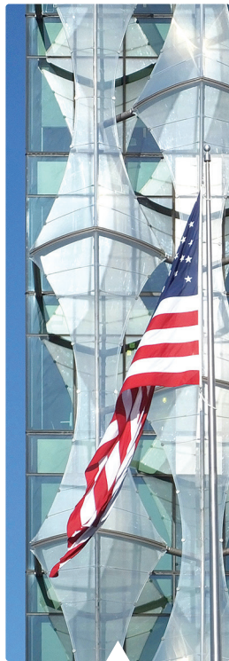
Embassy of the United States of America, Nine Elms, London

All interviews with candidates at diplomatic outposts paused “until further guidance is issued”, says Secretary of State Marco Rubio