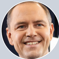
Karol Nawrocki : Law and Justice (right-wing)

Trzaskowski and Nawrocki will compete in second round on June 1