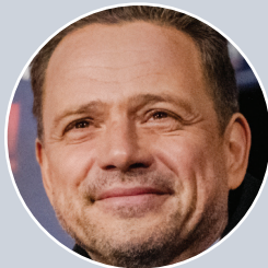
Rafał Trzaskowski Civic Platform (centrist)