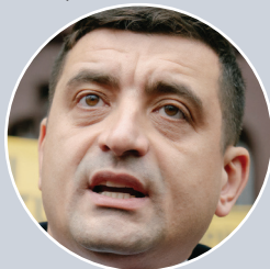
George Simion Alliance for the Union of Romanians (far-right)