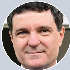
Nicușor Dan Independent (centrist)