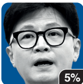
Han Dong-hoon Former party leader