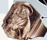
Pope Francis' fisherman's ring