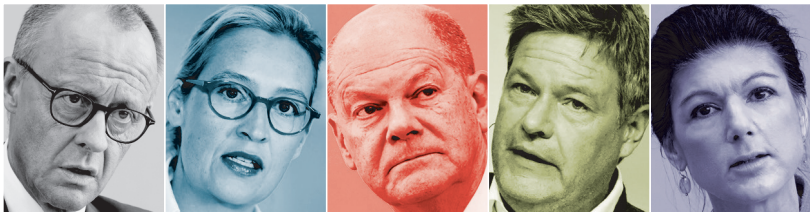
Friedrich Merz CDU/CSU

Germany could face months of political uncertainty after snap elections on February 23 as the winning party will almost certainly have to form a coalition to secure a majority