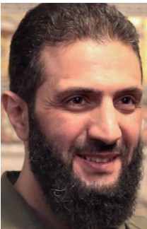
Ahmed al-Sharaa HTS leader has now dropped nom de guerre Abu Mohammed al-Golani linked with jihadist past

Syrian rebels who have ousted Bashar al-Assad and seized the capital Damascus include fighters from different factions, while other groups also hold territory elsewhere in the country