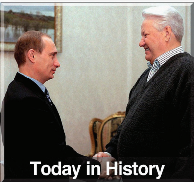
Today in History