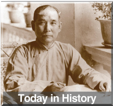
Today in History