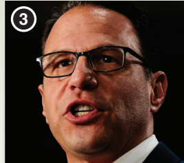
Governor Josh Shapiro Pennsylvania

PROS: Record of progressives policies, former NRA member. Served 12 years in Congress CONS: Unpopular with independents, not well-known nationally