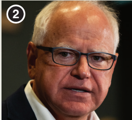
Governor Tim Walz Minnesota

PROS: Former Navy pilot and NASA astronaut. Strong on gun safety and border control. Notable fundraiser and popular with independent voters CONS: Lack of labour support