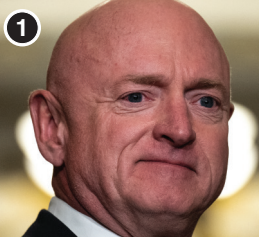
Senator Mark Kelly Arizona

Democratic nominee Kamala Harris must decide whether to pick a VP candidate who can appeal to parts of electorate she doesn't reach or focus on one who can help her govern if she wins in November