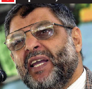
Abdel Aziz al-Rantisi