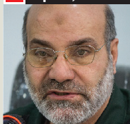
Mohammad Reza Zahedi

Brigadier General, Iranian Revolutionary Guard