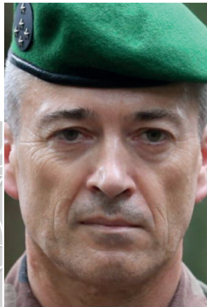
General Thierry Burkhard , Chief of Defence Staff, to deploy 15,000 troops as part of Opération Sentinelle , in addition to 30,000 police each day

With 25 competition venues in the Paris region and 13 in the capital alone, organisers have initiated Opération Sentinelle to provide “protective bubbles” around all Olympic sites