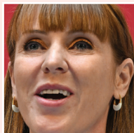
Angela Rayner Deputy Leader and Levelling Up