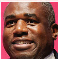
David Lammy Foreign Secretary