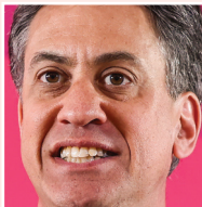
Ed Miliband Energy Security and Net Zero