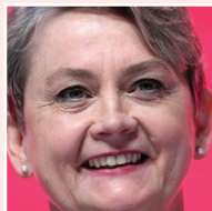
Yvette Cooper Home Secretary