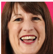
Rachel Reeves Chancellor of the Exchequer