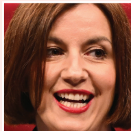
Bridget Phillipson Education