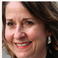
Liz Kendall Work and Pensions