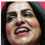
Shabana Mahmood Justice