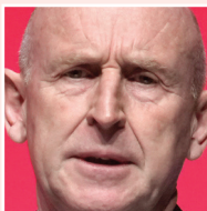
John Healey Defence