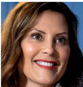
Gretchen Whitmer, 52 Michigan governor

Member of family which owns hotel chain Hyatt, is estimated to be worth $3.6bn, making him richest politician in U.S.