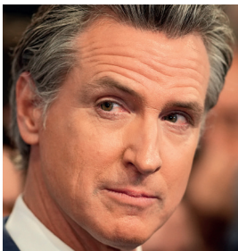
Gavin Newsom, 56 California governor

Most obvious choice for party to install as replacement, but poor polling ratings raise concerns that she could lose against Trump