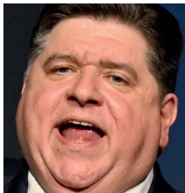
J.B. Pritzker, 59 Illinois governor

President's most effective and telegenic surrogate, has long appeared to be running shadow campaign as Biden's backup