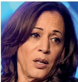
Kamala Harris, 59 Vice-president

President Joe Biden's halting debate performance has led some in his own Democratic party to begin questioning whether he should be replaced on the ballot before November