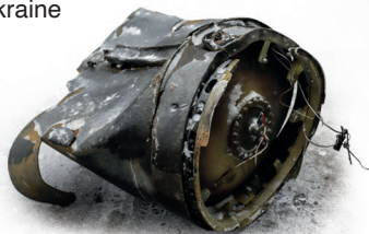
Debris of short-range Hwasong-11A ballistic missile used in Jan 2 strike on Kharkiv

■ Jan 4, 2024: U.S. says Russia has launched ballistic missiles produced in North Korea in strikes against Ukraine