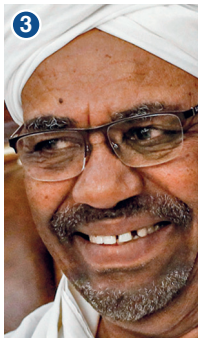
3. Omar al-Bashir

► Kony, founder of Lord's Resistance Army responsible for atrocities across Uganda from 1990s, thought to be hiding in Central African Republic or Sudan