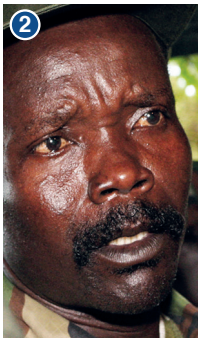
2. Joseph Kony

► Russia, which does not recognise ICC, has issued retaliatory arrest warrant on ICC chief prosecutor, British lawyer Karim Khan