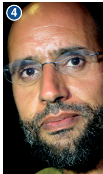
4. Saif al-Islam Gaddafi

► Jailed in Sudan after popular uprising in 2019. Moved from prison to military hospital near capital Khartoum in April 2023