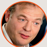
Pieter Omtzigt New Social Contract (NSC)