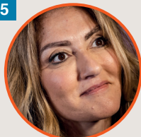
Dilan Yeşilgöz People's Party for Freedom and Democracy (VVD)