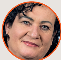
Caroline van der Plas Farmer-Citizen Movement (BBB)