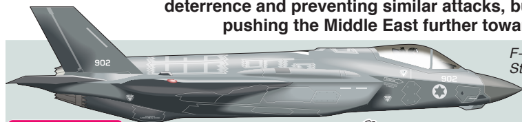
F-35 Joint Strike Fighter

Israeli retaliation for Iran's missile attack will focus on reestablishing deterrence and preventing similar attacks, but any response risks pushing the Middle East further towards all-out war