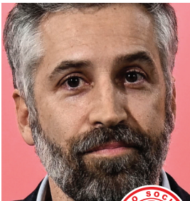
Pedro Nuno Santos

Another far-right populist party is on track to secure up to a fifth of the vote in Portugal's general election on March 10