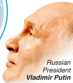
Russian President Vladimir Putin