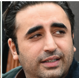
Bilawal Bhutto Zardari

Three-time former prime minister leads PML-N . Party in discussion with PPP to form central government