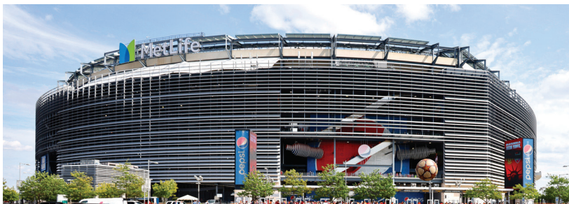
MetLife Stadium: East Rutherford, New Jersey

The MetLife Stadium will stage the 2026 World Cup final on July 19, the climax of a record 39-day long tournament co-hosted by the United States, Mexico and Canada