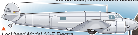
Lockheed Model 10-E Electra

The wreckage of Amelia Earhart's long-lost plane has been found on the bottom of the Pacific Ocean, around 5,000 metres beneath the surface, researchers believe