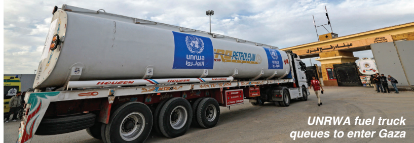
UNRWA fuel truck queues to enter Gaza

Multiple countries have temporarily halted funding to the UN agency for Palestinian refugees, known as UNRWA, over accusations of staff involvement in Hamas' October 7 attack on Israel