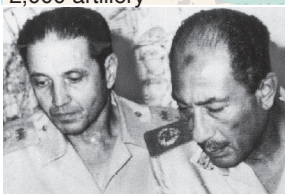
Chief of Staff General Saad El Shazly with Sadat

Egypt: 100,000 troops, 1,300 tanks, 2,000 artillery