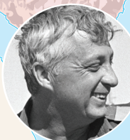
Ariel Sharon – insubordinate but intuitive military commander