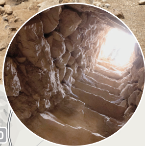
Neolithic staircase inside tower