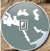
Early Bronze Age Palace at Tell es-Sultan

Prehistoric ruins near the ancient city of Jericho – one of the world's oldest continuously inhabited sites – have been designated a World Heritage Site in Palestine, despite protests by Israel