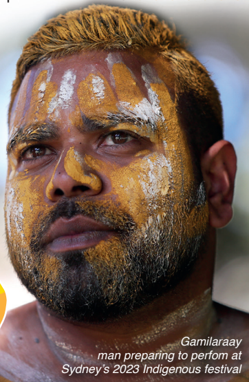
Gamilaraay man preparing to perform at Sydney's 2023 Indigenous festival