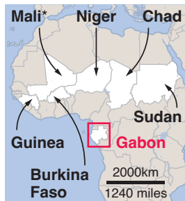
Africa: Eight coups since 2020