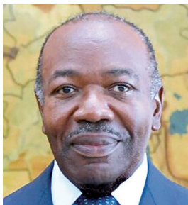
President Ali Bongo: Under house arrest