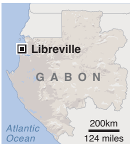
Gabon: Among Africa's biggest oil-producers