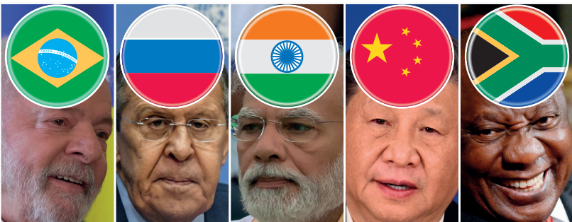
Brazil President Lula da Silva Russia Foreign Minister Sergey Lavrov India Prime Minister Narendra Modi China President Xi Jinping South Africa President Cyril Ramaphosa

The five BRICS emerging world economies – Brazil, Russia, India, China and South Africa – aim to develop trade and economic cooperation that can challenge the developed world's dominance