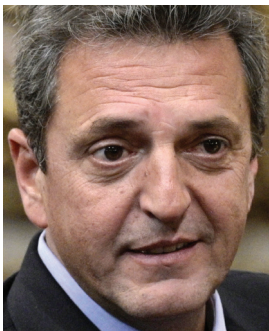
Sergio Massa, 51 Union for the Homeland (centre-left)

Argentina's race for the presidency is between three candidates – a far-right outsider and two politicians from the main coalitions