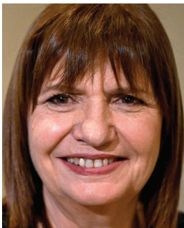
Patricia Bullrich, 67 Together for Change (centre-right)