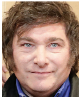
Javier Milei, 52 Liberty Advances (far-right)