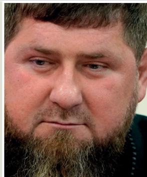
■ Ramzan Kadyrov, 46: Leader of Russian republic of Chechnya – nicknamed "Putin's attack dog." Deployed some 3,000 fighters in bid to stop attempted coup