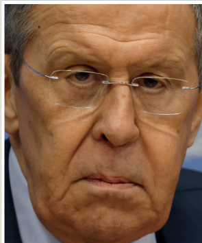
■ Sergey Lavrov, 73: Russia's top diplomat and Foreign Minister, is no longer part of Putin's inner circle. Reportedly sidelined from decisions regarding Ukraine