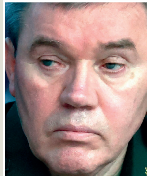
■ Valery Gerasimov, 67: Chief of the General Staff, replaced Surovikin as top commander of war in Ukraine in January. Has not been seen publicly or on TV since Saturday's aborted coup. FSB security service is reportedly questioning him