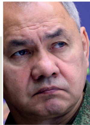
■ Sergei Shoigu, 68: Defence Minister since 2012 and veteran Putin ally. Oversaw annexation of Crimea and invasion of Ukraine. Rumours that Shoigu will be ousted if war fails