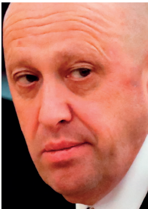
■ Yevgeny Prigozhin, 62: Former close ally of Putin. Wagner's chief became embroiled in public feud with Russia's top officials – Defence Minister Sergei Shoigu and top General Valery Gerasimov

The armed rebellion by Yevgeny Prigozhin and his Wagner mercenary group has become a pretext for a purge in the ranks of the Russian Armed Forces