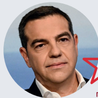
Alexis Tsipras Syriza party

Centre-right prime minister Kyriakos Mitsotakis has won a major election victory, setting up a second vote in the summer that could give his party an outright majority in parliament