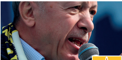
Recep Tayyip Erdoğan, 69:

As Türkiye votes for president and parliament, “Table of Six” opposition leaders are focused on a deep economic crisis, sky-high inflation and the aftermath of catastrophic earthquakes that killed 50,000 people