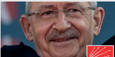
Opposition Table of Six