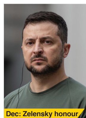
Dec: Zelensky honour

JAN 14 A volcanic eruption in Tonga triggers tsunamis across the Pacific Ocean