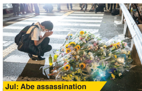
Jul: Abe assassination