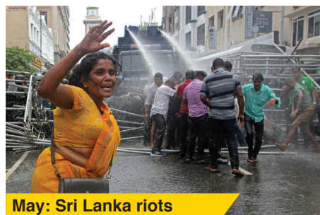
May: Sri Lanka riots