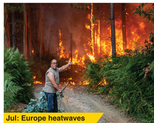
Jul: Europe heatwaves