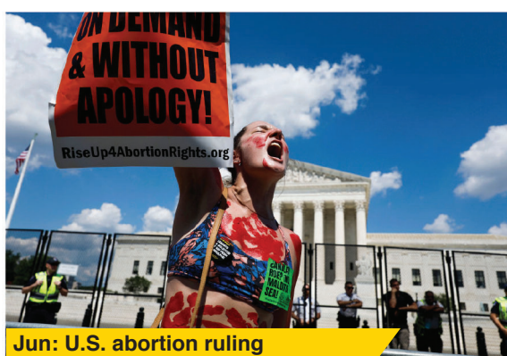
Jun: U.S. abortion ruling