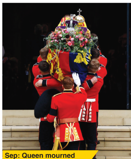
Sep: Queen mourned