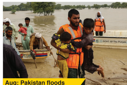
Aug: Pakistan floods