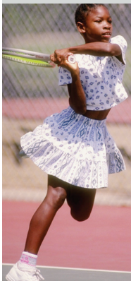
Serena in action in 1992