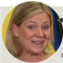
Prime Minister Magdalena Andersson (Social Democrat)

With the right-wing and left-wing blocs neck-and-neck in the polls, Sweden appears destined for a minority government after the September 11 election