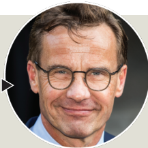
Opposition leader Ulf Kristersson (Moderate)