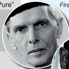
Jinnah: First Governor General of Pakistan