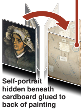
Self-portrait hidden beneath cardboard glued to back of painting