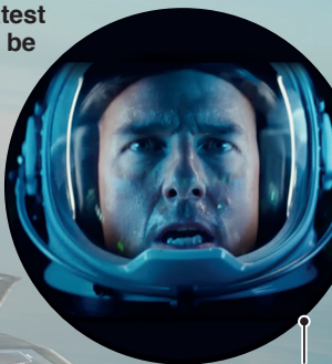
Tom Cruise piloting Darkstar

DARKSTAR: Full-sized physical mock-up and airborne CGI plane – designed with help from Lockheed Martin engineers – bears striking resemblance to artists’ renderings of SR-72