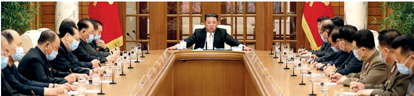
▲ May 12, 2022: Kim Jong-un presides over Workers' Party meeting

A first public admission of Covid infections in North Korea could signal a looming crisis for a nation that has refused to vaccinate its population