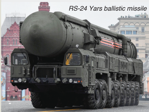
RS-24 Yars ballistic missile

*Weapons of mass destruction (chemical, biological, radiological or nuclear weapons)