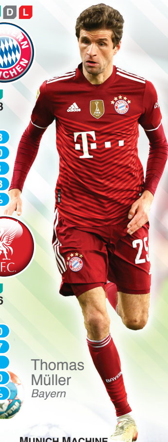
Thomas Müller Bayern