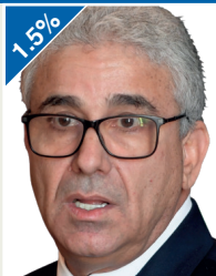
Fathi Bashagha, 59: Former Interior Minister and key player in GNA. Envisages "new Libya" based on justice, respect for human rights and market-led economy. Most support in west, but little elsewhere

*Diwan Research national poll of 1,106 registered voters, December 1-5. Margin of error: 3%