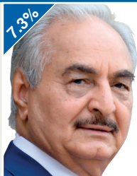
Khalifa Haftar, 78: Leader of eastern coalition of troops and militias known as Libyan National Army . Warlord is backed by Russia, Egypt and United Arab Emirates. Strong support in east