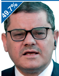
Abdul Hamid Dbeibah, 63: Interim Prime Minister of Government of National Accord (GNA) . Construction mogul turned politician, leads all candidates in west, east and south