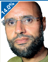
Saif al-Islam Gaddafi, 49: Son of slain dictator Muammar Gaddafi . Wanted by International Criminal Court for alleged war crimes. Says he wants to "restore lost unity." Most support in south